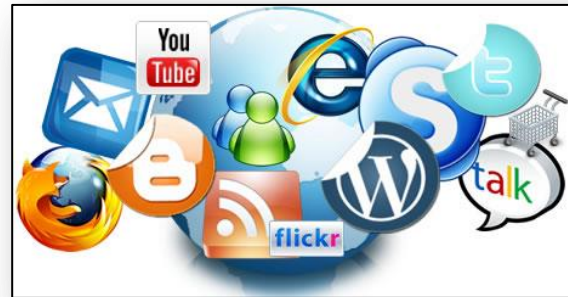
Internet, Social Media