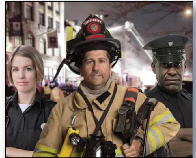
Knowing First Responders Can Arrive