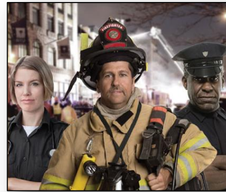
Knowing First Responders Can Arrive