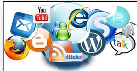
Internet, Social Media