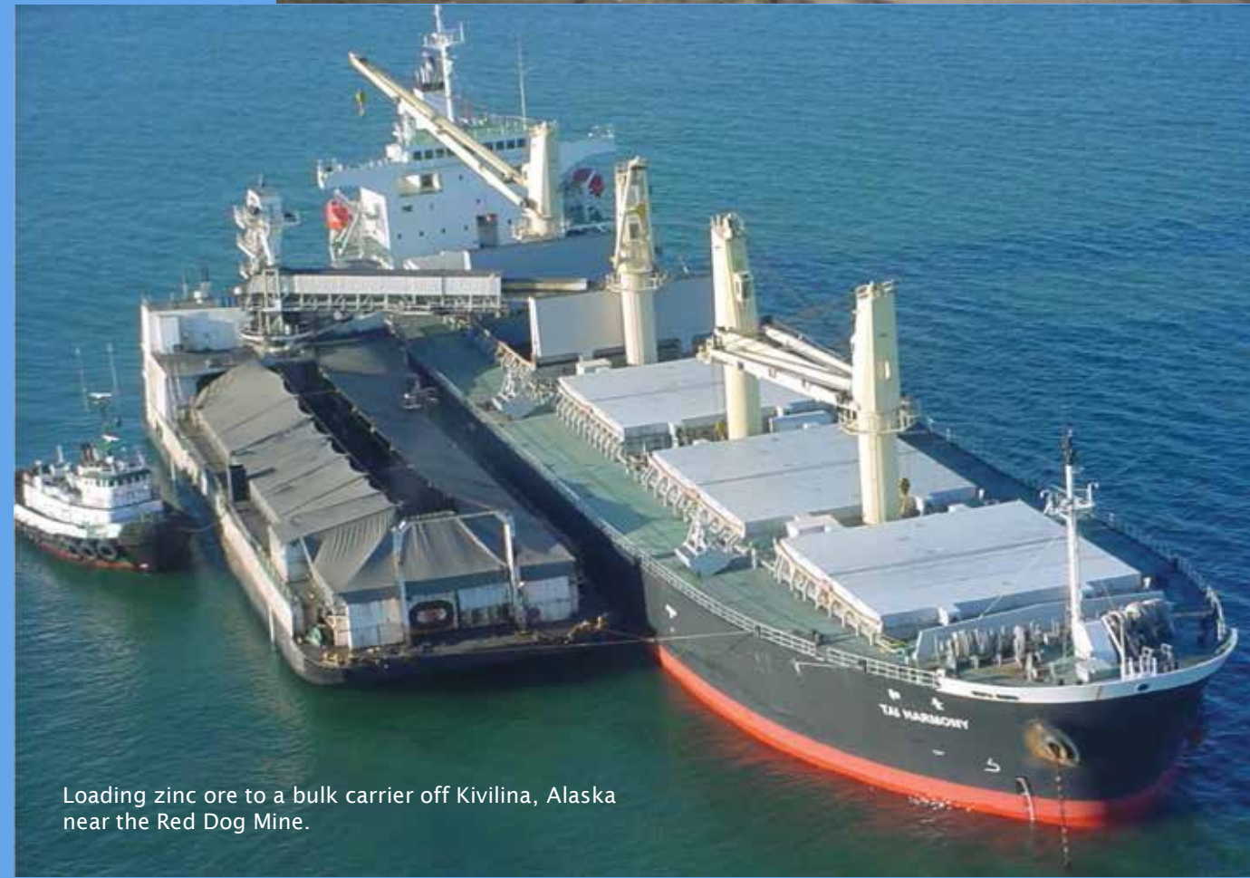
Loading zinc ore to a bulk carrier off Kivilina, Alaska near the Red Dog Mine.