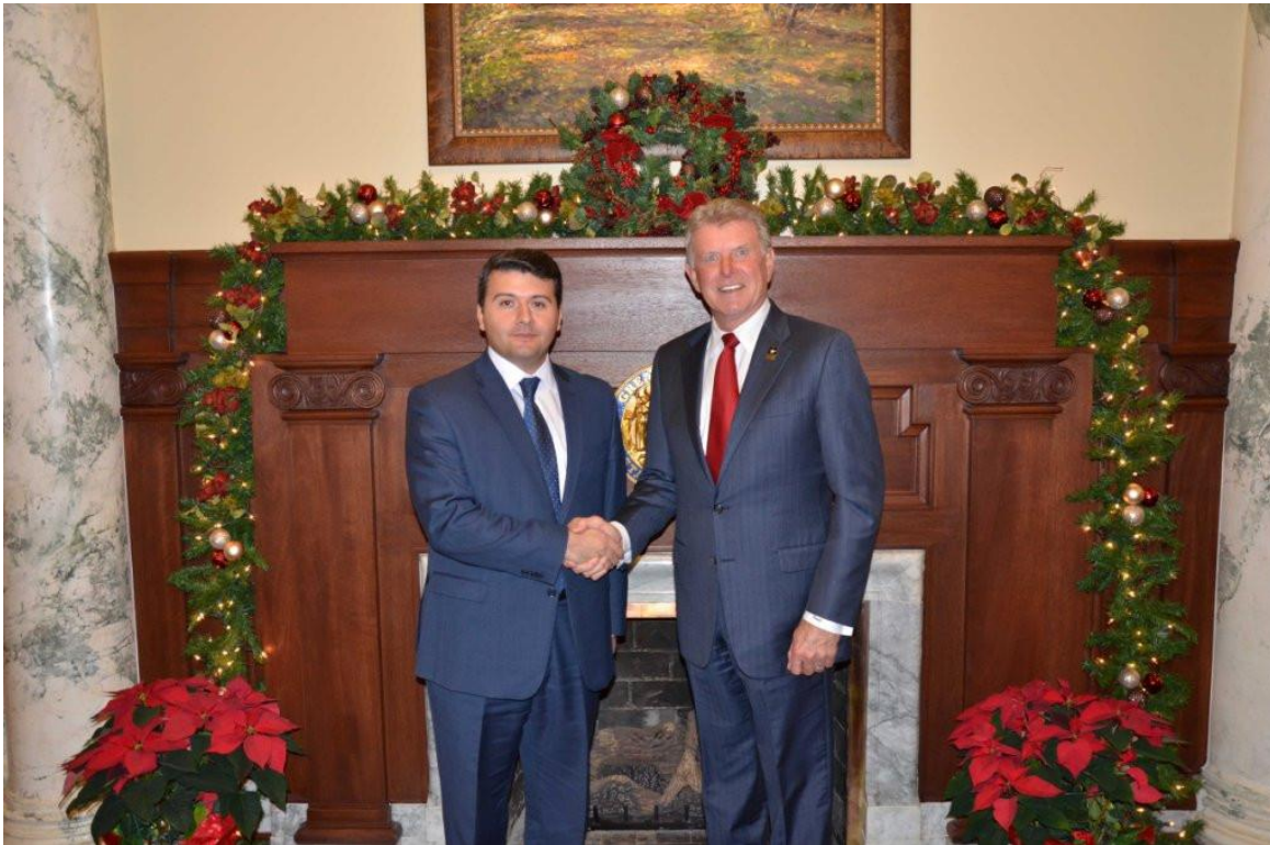
Consul General of Azerbaijan Visit in Boise, ID 2015