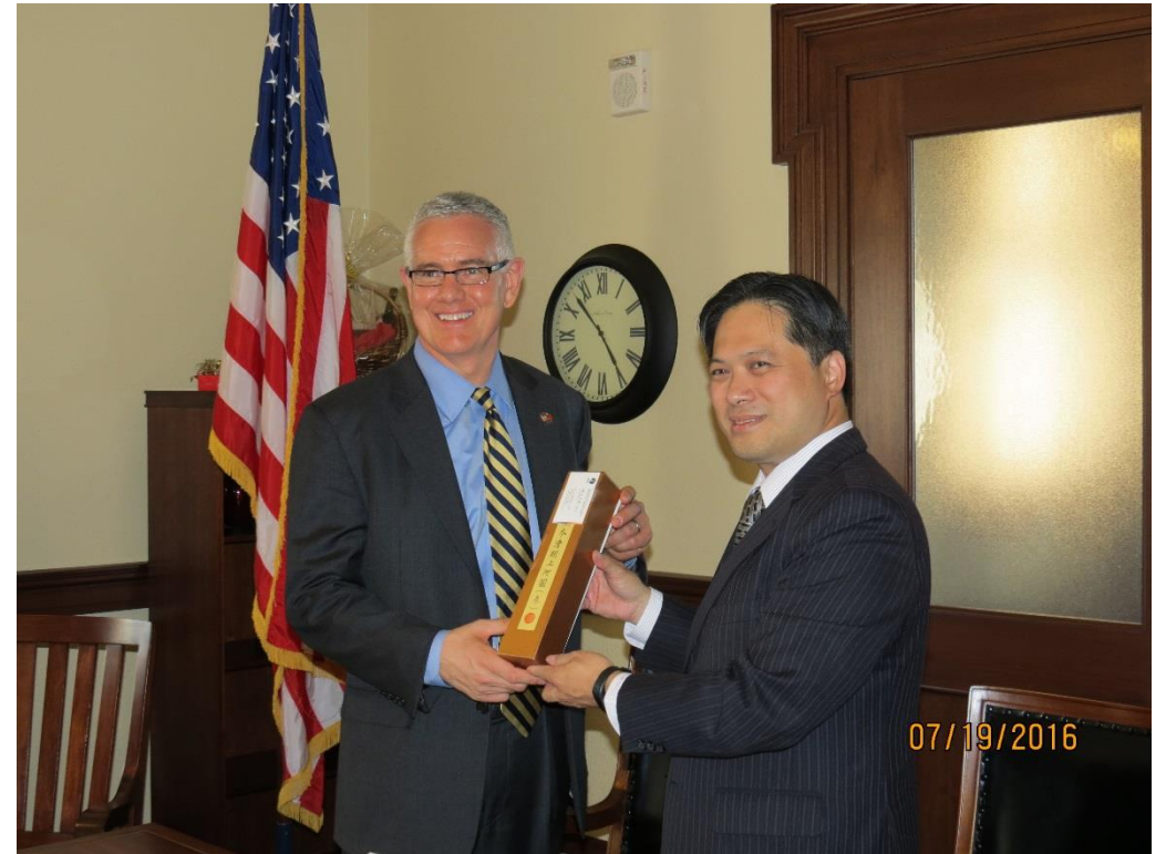
Taiwan Ministry of Economic Affairs Visit in Boise, ID 2015