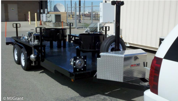
Mobile Training Trailers.

Training Tank Cars. Schedule for large events, has a classroom built in.