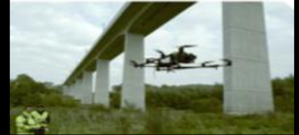
Bridges & Infrastructure